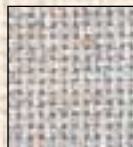
Blue Neutral Code: QE