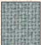
Aquamarine Code: QK

* Complete item code with panel fabric desired from the following Equal colors: