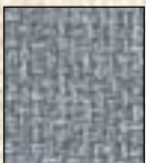
Wedgewood Code: QH