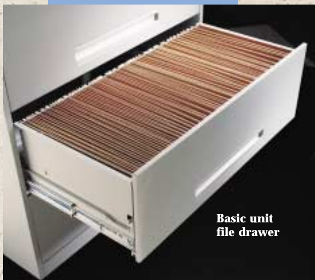
Basic unit file drawer

A wide variety of sizes, styles and options allows for complete flexibility in space planning.