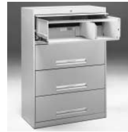
F53-43620-21 with optional Follower Plate F53FP-21