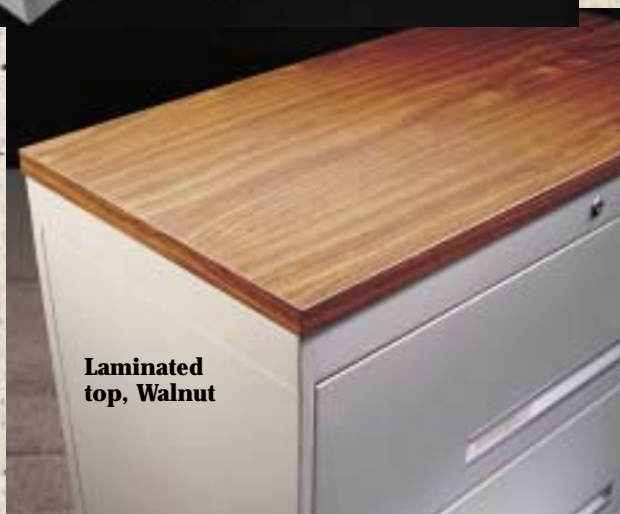
Laminated top, Walnut