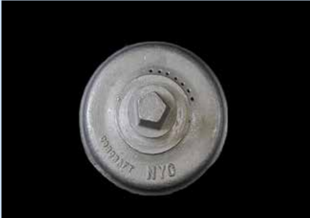
Hydrant Spray Cap M0679002

Our aluminum hydrant supplies require no maintenance. They are impact- and rust-resistant.