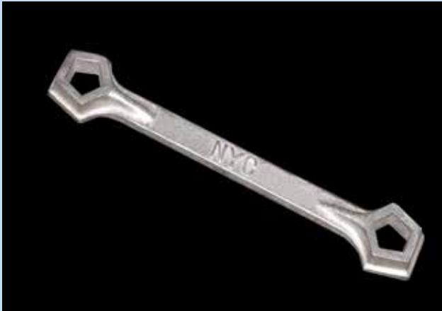
Hydrant Wrench M0679000