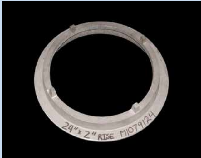
24" Diameter x 2" Rise extension ring