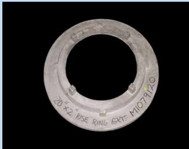
20" Diameter x 2" Rise extension ring