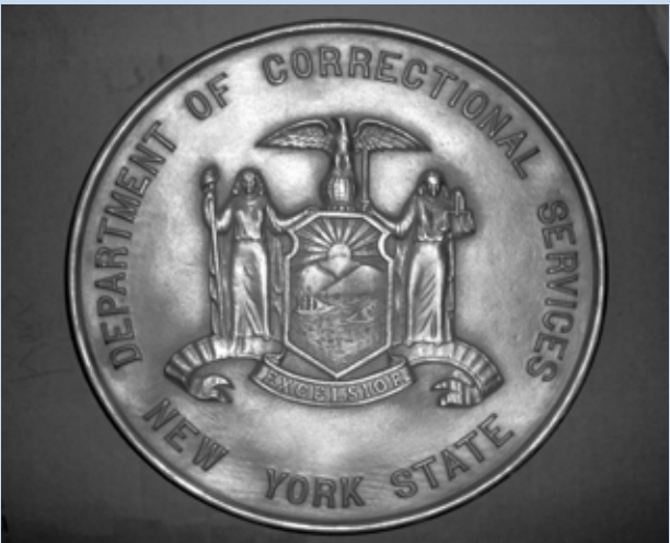
State agency emblem