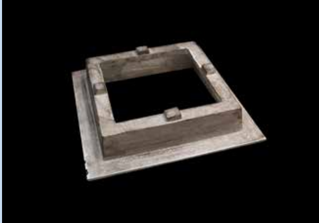
Hydrant Valve Box 7" x 7" x 1.5" rise M06750070