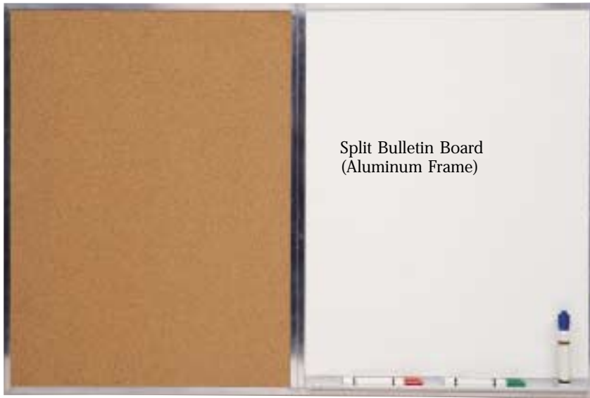
Split Bulletin Board (Aluminum Frame)

The whiteboard/corkboard split combination allows you to use an erasable marker on one side and tack messages on the other.