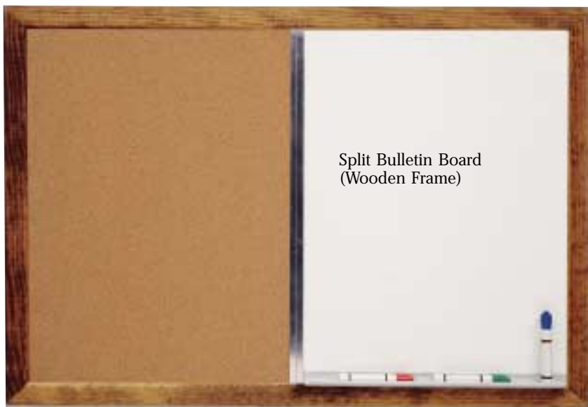
Split Bulletin Board (Wooden Frame)