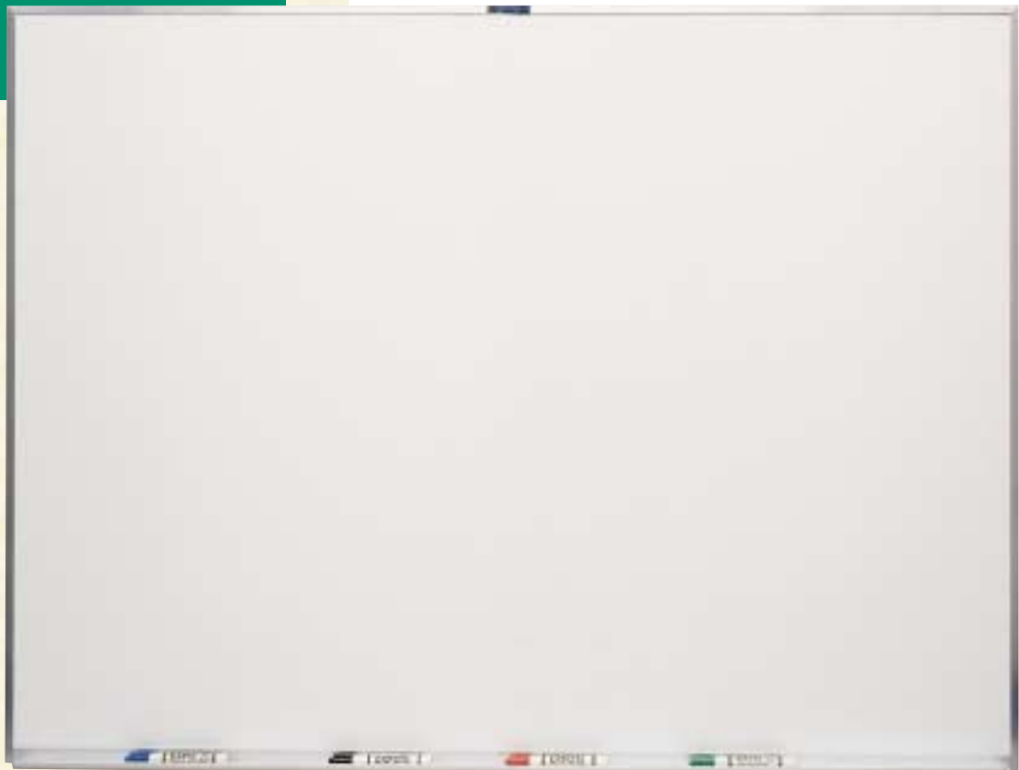
White Eraser Board (Aluminum Frame)